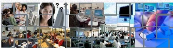
PROGRAMUL DE FORMARE A PROFESORILOR INGINERI DPPD - UPB & Colegiul "Gh. Airinei"

Module 1: Setting, organization and valuation of the didactic activities - 30 credit points